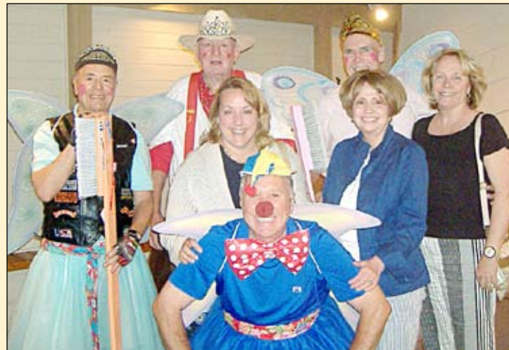
Tooth Fairy Bingo II. A thank you to the Highlands Rotary Bingo Team, Boy Scouts of Troop 207, the Tooth Fairies and our partner, Cashiers Rotary, for raising more than $1000 for children's dental care at the Blue Ridge Free Dental Clinic.

The Monthly Board Meeting has been re-scheduled to 8 am, Thursday, July 15 at the Civic Center. All Rotarians are invited to attend – see how the Board works and earn a make-up.