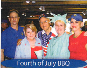
Fourth of July BBQ