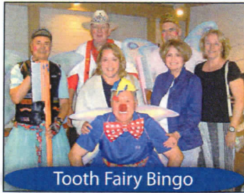
Tooth Fairy Bingo