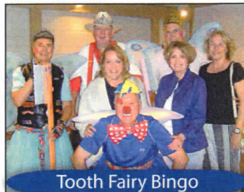
Tooth Fairy Bingo