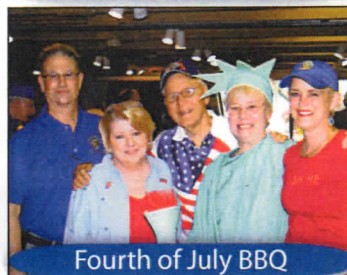
Fourth of July BBQ